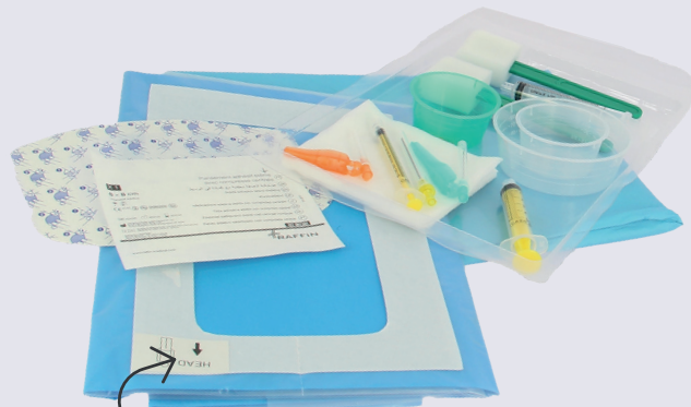
NR Fit® peridural and rachidian anaesthesia set