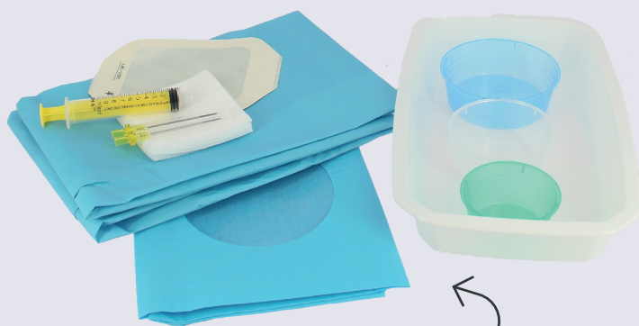
NR Fit® anaesthesia set N°18